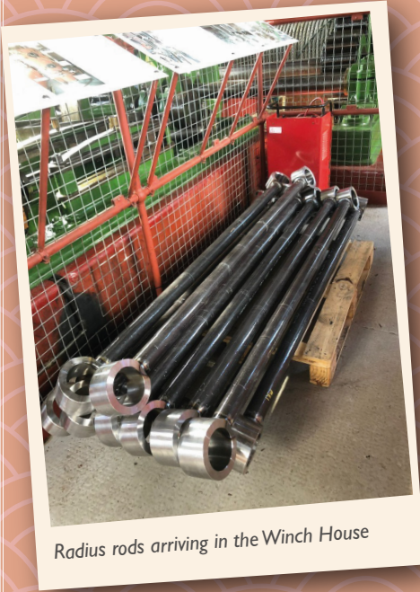
Radius rods arriving in the Winch House

“Since the last edition things have moved on considerably and as we go from Autumn into Winter the focus has to be adjusted until the Spring.