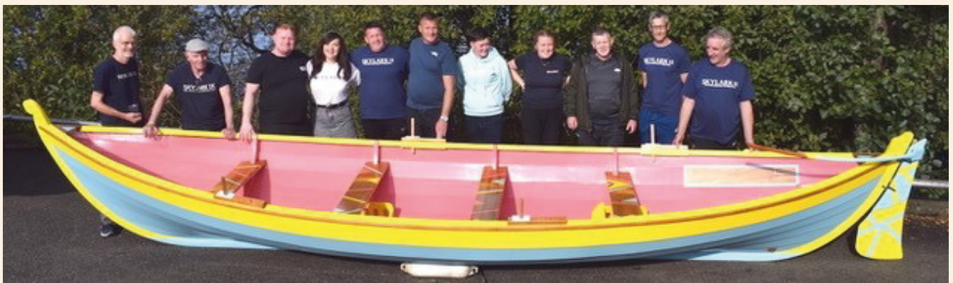
Image: Launch ceremony at Balloch Pier