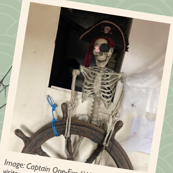
Image: Captain One-Eyed Willy welcomes visitors on board PS Maid of the Loch