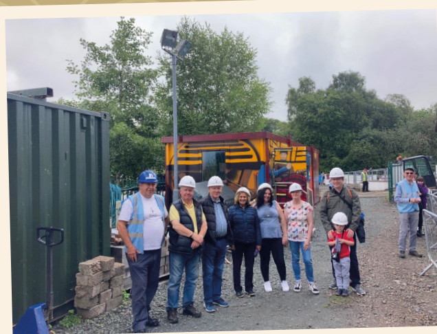
The Hard Hat Tours have been popular this season.

WE ARE CLOSED TO THE PUBLIC DURING WINTER, but our volunteers will be working on the restoration project weekdays, when Hard Hat tours can be arranged in advance.