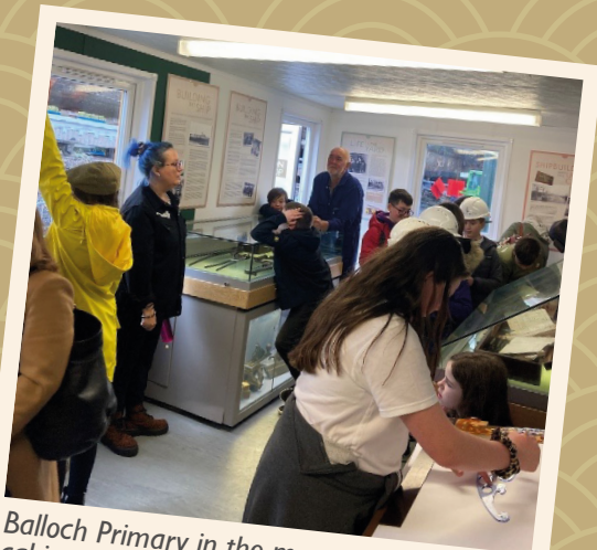
Balloch Primary in the museum cabin studying collections