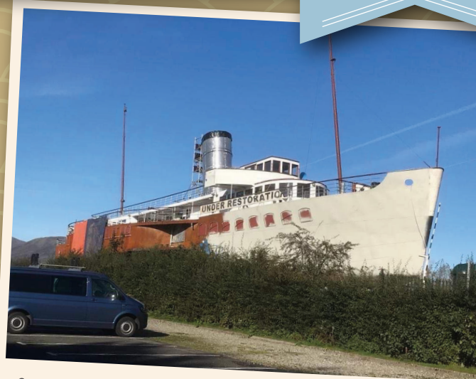
Starboard side of the ship with primer paint coat

It is the selfless support of volunteers, but equally the contributions from our contractors who donate and go