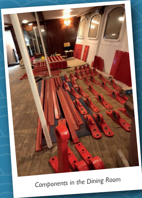
Components in the Dining Room

A small team led by volunteer Robert Cudahy is progressing well on preparing the components of the paddles for assembly.