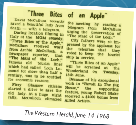
The Western Herald, June 14 1968