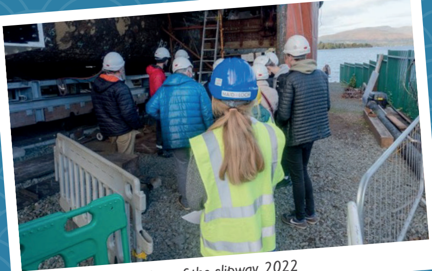
Tour of the slipway, 2022

Along with ticket price - visitors have free access to our museum cabin, winch house and special exhibitions.