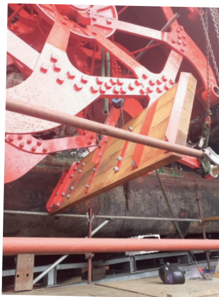
Starboard paddle float close up