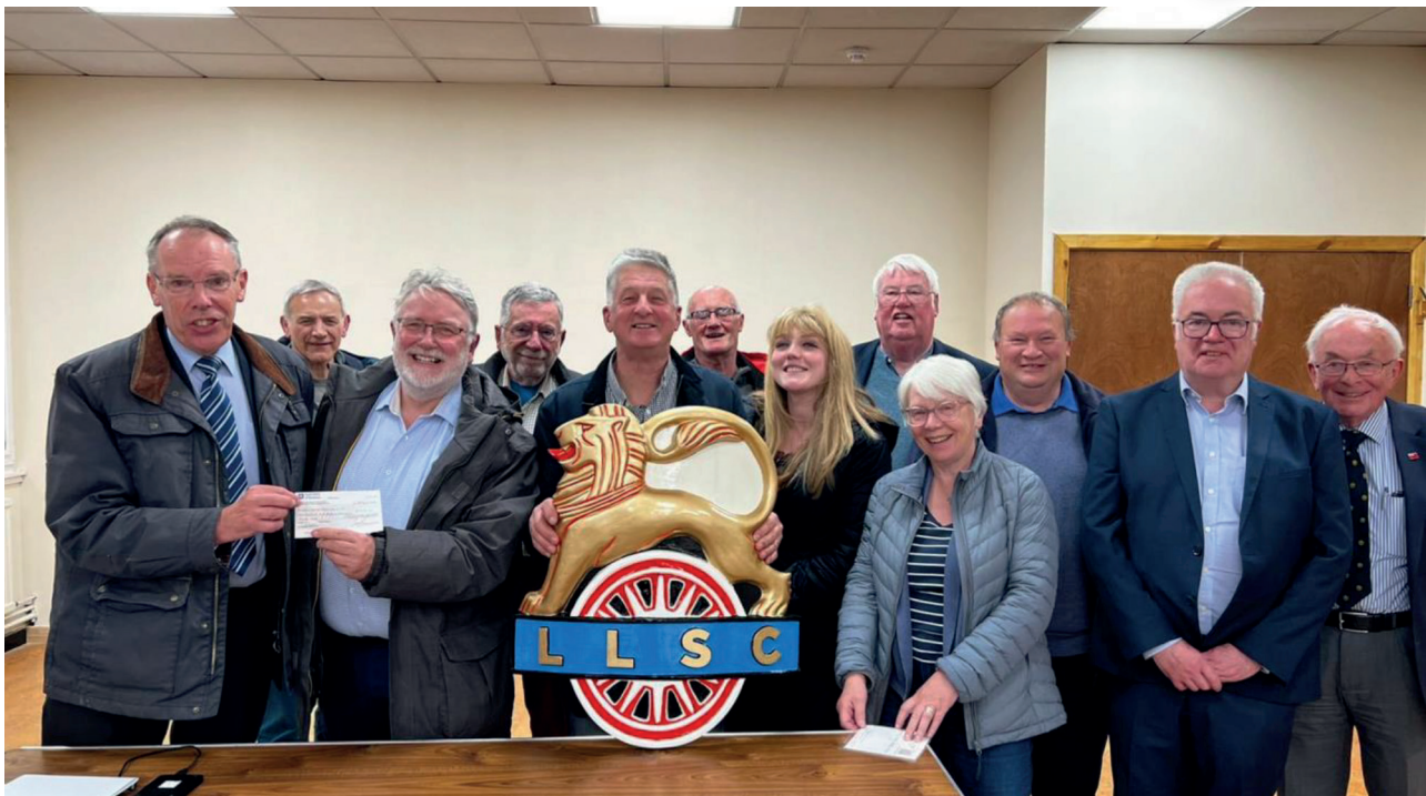
LLSC Bow Crest presented at the most recent PSPS AGM

We are delighted to announce receipt of a substantial grant from the Paddle Steamer Preservation Society, with its worldwide membership once more supporting the restoration of our Maid.