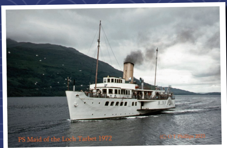
PS Maid of the Loch Tarbet 1972

"I thoroughly enjoyed my visit and was pleased to see the progress being made. I have attached a copy of a colour slide which I took in July 1972 of PS Maid of the Loch arriving at Tarbet."